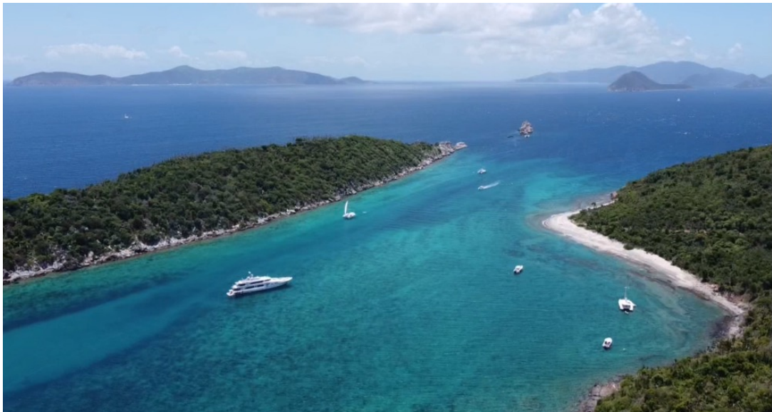
Return to Yacht Haven Grande in the morning after a final brunch and depart by 12pm.